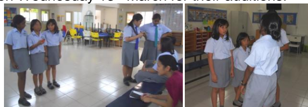
Scenes from the Audition

Auditions were carried out with a mixed group of students on Wednesday 6 th March afternoon. Students who missed the auditions will be called on Wednesday 13 th March for their auditions.