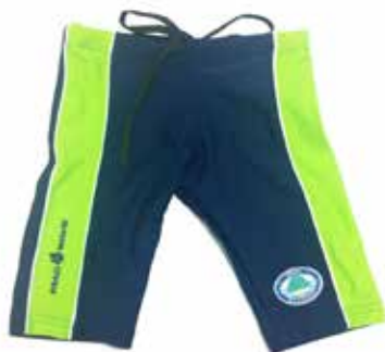
Trunks (Sizes: S - XXL) RM 40.00