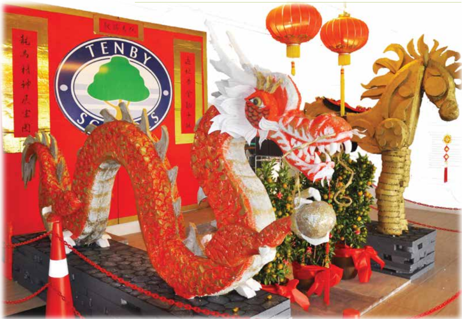
Chinese New Year Decoration by Tenby's Art Department.

We would like to wish everyone a Happy Chinese New Year. May the year of the Horse bring joy and happiness to all!