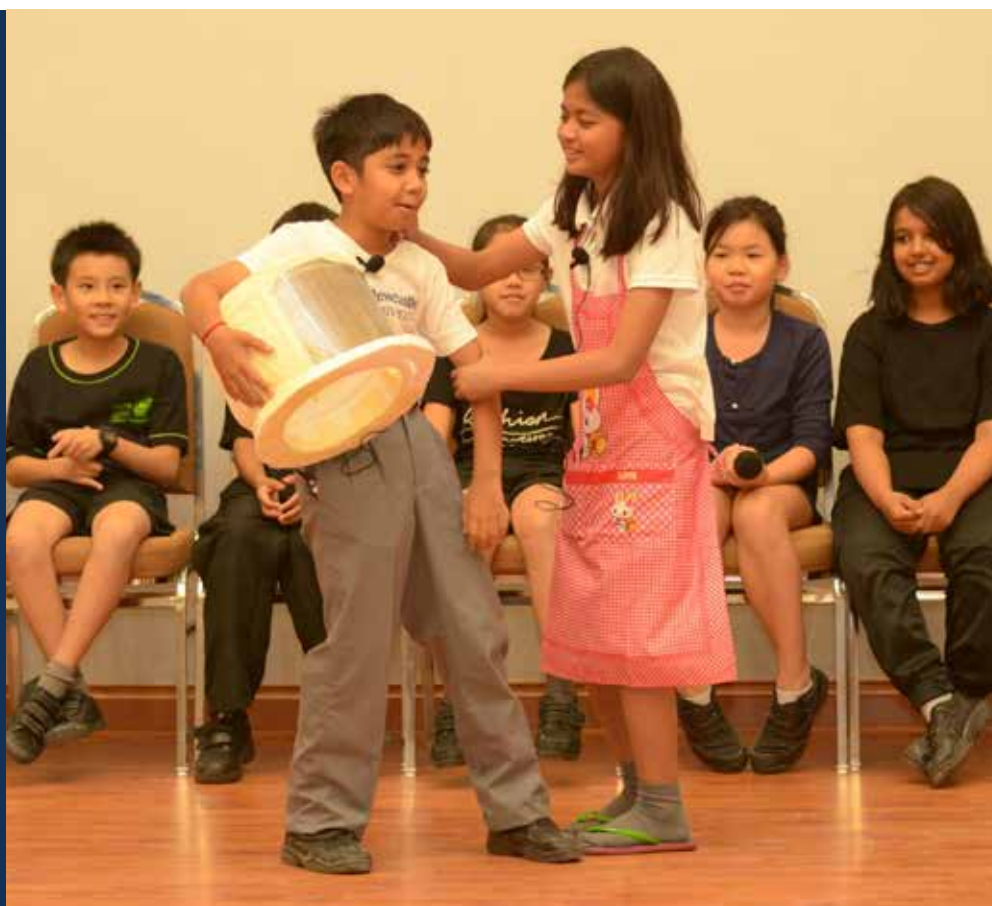
Eureka! Eureka! : Year 5 students performing during the special assembly.

There will be another special assembly for Year 4 on Friday, 28 February 2014, and it will be based on their current IPC Topic, 'Significant People'.